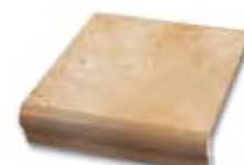
Toledo Beige Peldaño Torello 31,6x31,6 PEI-IV C-780