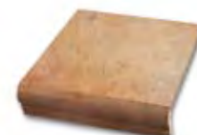
Ares Rosso Peldaño Torello 31,6x31,6 PEI-III C-780