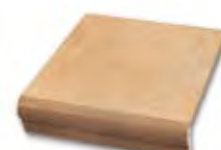
Ares Ocre Peldaño Torello 31,6x31,6 PEI-V C-780