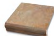
Almansa Tierra Peldaño Torello 31,6x31,6 PEI-IV C-780