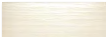
Mustang Nacár 20x59,2 C-515