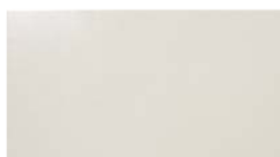
Triumph Nacár PEI-III 31,6x59,2 C-915