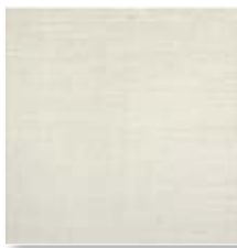
Cicerone Nacár PEI-IV 31,6x31,6 C-890

pavimento coordinado | 31,6x31,6 | 12.4"x12.4" matching floor tiles | 31,6x59,2 | 12.4"x23.3"