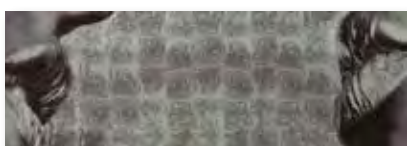
Lips Plata Decor 4 20x59,2 C-359