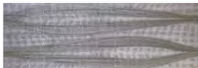
Mustang Plata Decor 20x59,2 C-355