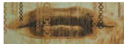
Lips Oro Decor 4 20x59,2 C-359

pavimento coordinado | 31,6x31,6 | 12.4"x12.4" matching floor tiles | 31,6x59,2 | 12.4"x23.3"