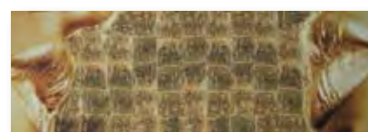
Lips Oro Decor 4 20x59,2 C-359