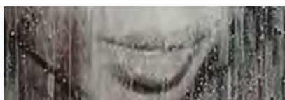
Lips Plata Decor 4 20x59,2 C-359