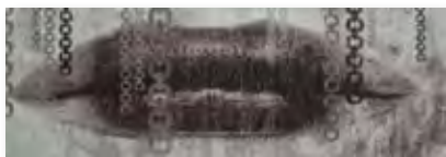
Lips Plata Decor 4 20x59,2 C-359