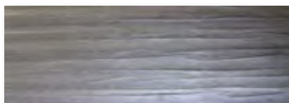
Mustang Plata 20x59,2 C-574