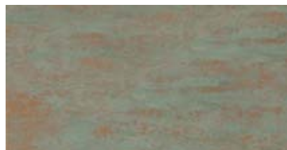
Oxon Verde 31,6x59,2 PEI-IV C-910