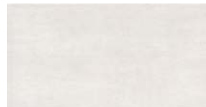
Rivets Nacar 31,6x59,2 PEI-IV C-890